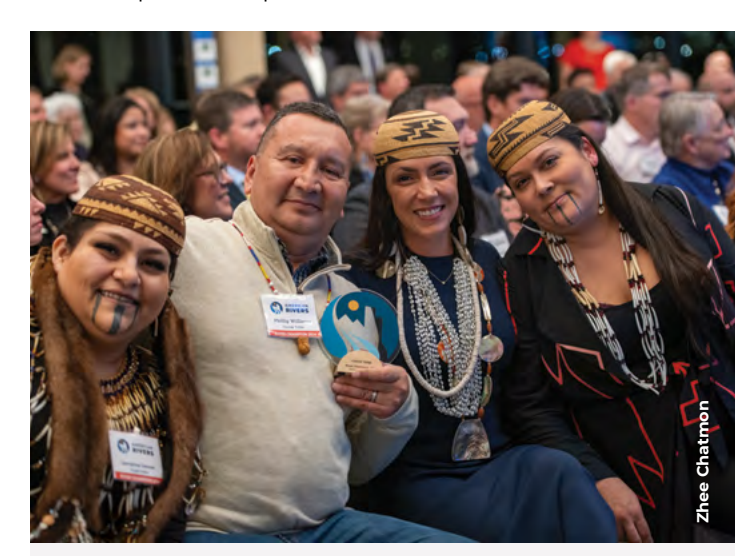
Learn more about these 2024 River Champions: ► AmericanRivers.org/RiverChampionAwards

wenty-five years ago, the idea of removing a dam was considered radical, even impossible. Today, it's a proven method for restoring health to rivers which in turn revives fish and wildlife populations, protects cultural resources, and enhances public safety for local communities. This paradigm shift can largely be attributed to American Rivers and our unique approach of bold vision, strategic expertise, dedicated advocacy, and inclusive partnerships.