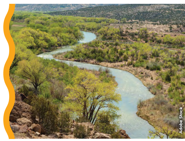
Rio Chama, New Mexico

New Mexico's waterways face unprecedented threats, with nearly all rivers and wetlands at risk of pollution due to the loss of Clean Water Act protections. Yet recently, a significant breakthrough has inspired hope for the future. New Mexico allocated funding for a state program to regulate pollution and joined the America the Beautiful Freshwater Challenge. This ambitious initiative by the Biden administration sets a national goal to protect, restore, and reconnect 8 million acres of wetlands and 100,000 miles of our nation's rivers and streams by 2030. Our America's Most Endangered Rivers® listing and partners' leadership played important roles in raising public awareness and securing these positive steps forward. Looking ahead, we're committed to supporting our partners as they gear up for a critical year of advocating to restore clean water protections in state laws and regulations.