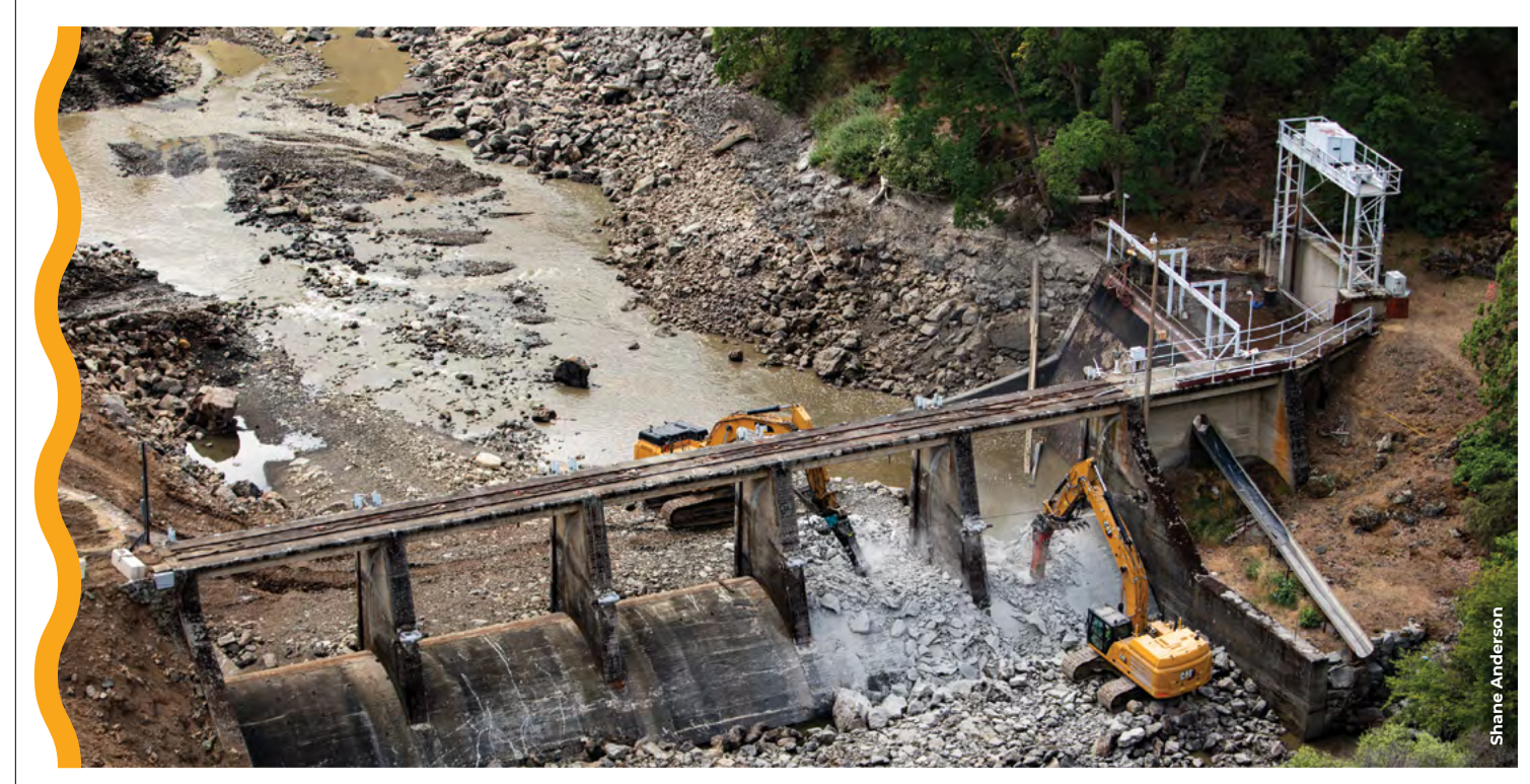
The first dam removal on California and Oregon's Klamath River, kicking off the largest dam removal project in history.

Your support is rippling out toward a future of healthy, free-flowing rivers