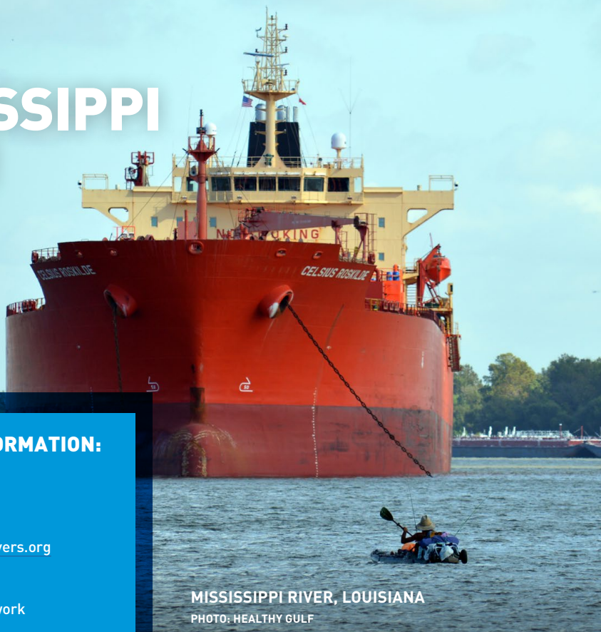
MISSISSIPPI RIVER, LOUISIANA

AmericanRivers.org/ MississippiRiver2022