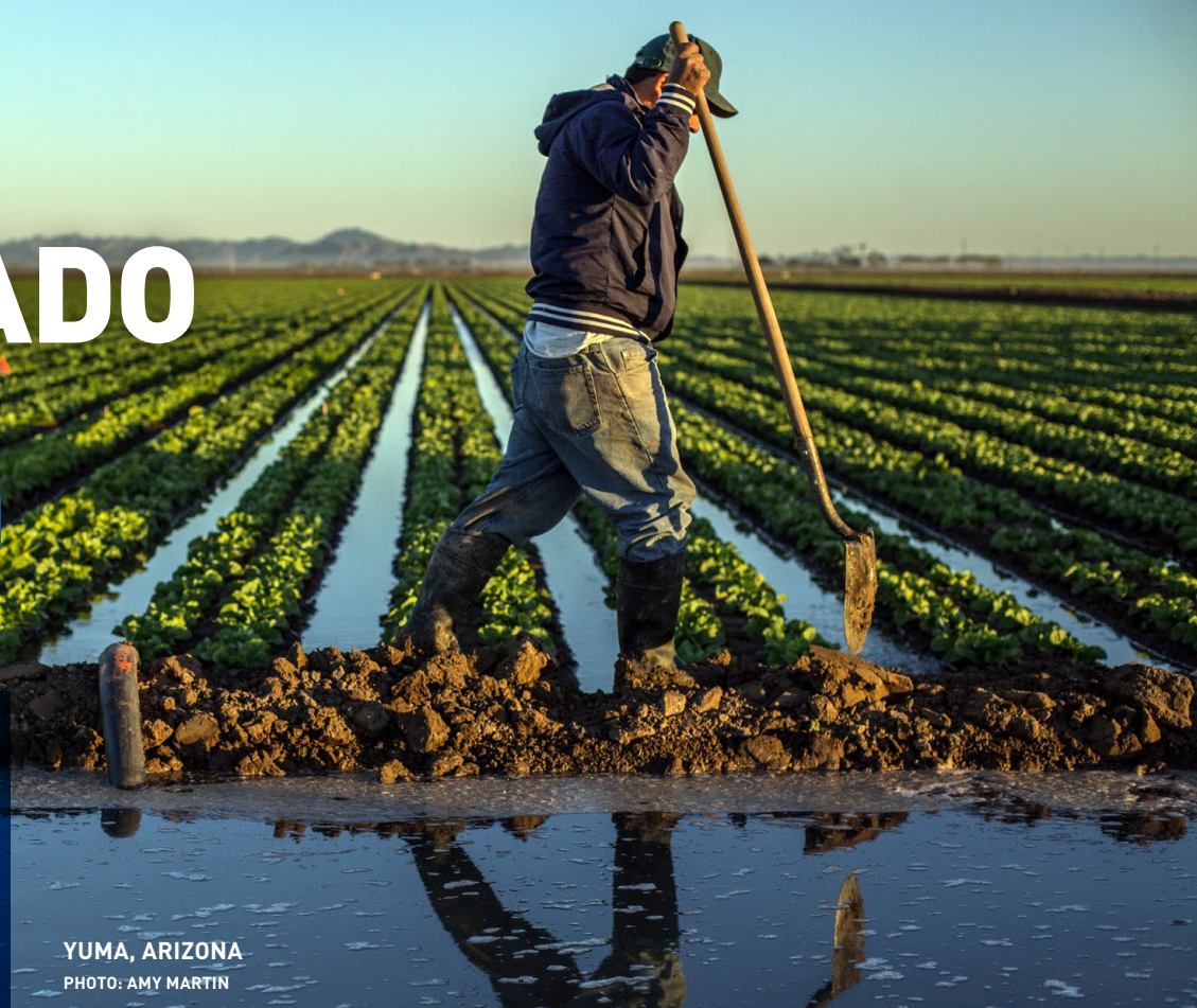
YUMA, ARIZONA

The Colorado River provides drinking water for 40 million people, irrigates five million acres of farm and ranch land, and supports a $1.4 trillion economy. All of this is at risk due to rising temperatures and drought driven by climate change, combined with outdated river management and overallocation of limited water supplies. River flows are at historic lows and the levels of Lake Powell and Lake Mead reservoirs are dropping precipitously. With the passage of the Infrastructure Investment and Jobs Act, the seven basin states and the Biden administration now have a critical opportunity to implement proven, equitable solutions that enhance water security and river health, while building resilience to future climate change. Failure is simply not an option, given all that depends on a healthy, flowing Colorado River.