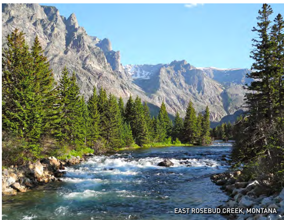
EAST ROSEBUD CREEK, MONTANA

No one should have to worry about the safety of their water — or whether there will be enough for the future. American Rivers has helped communities everywhere from Atlanta to Tucson promote sustainable water use and equitable, resilient, innovative ways of managing drinking water, stormwater and wastewater to meet both community and ecosystem needs. We are also demonstrating how protecting source water benefits supply chains, livelihoods and quality of life. In major river basins, from the Southeast's Apalachicola-Chattahoochee-Flint to the Southwest's Colorado River, we have been instrumental in moving debates over scarce water resources from conflict toward collaboration.