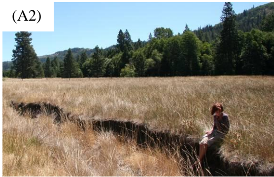
Bank height greater than 4 feet, score=1 (Bear Valley, Bear River Watershed)