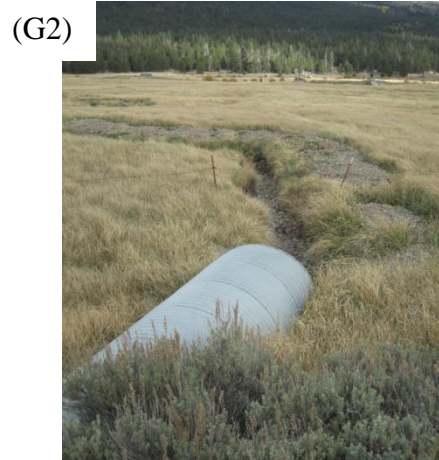
A ditch with vegetated banks in Hope Valley (Carson Watershed).

(4) Vegetation Cover: This question and the following one are derived from the toe-point transects (see description below). The % graminoid cover is a correlate for vegetation function –a measure of how much the vegetation stabilizes the soil (D. Weixelman pers. comm., J. Roccio 2006)