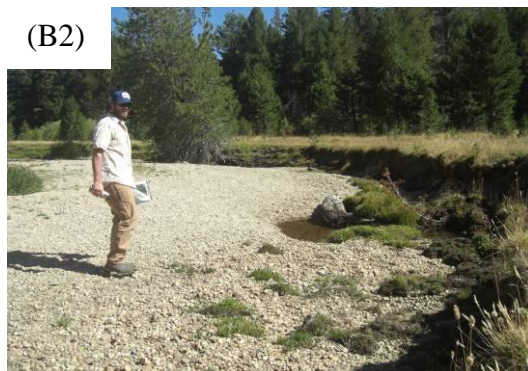
Bank height 2-4 feet, score=2 (Pacific Valley, Mokelumne Watershed)