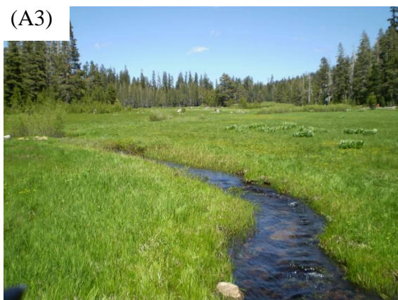
Bank height 0-2 feet, score=4 (Austin Meadow, Yuba River Watershed)