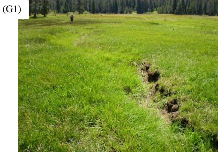
Headcut and gully forming in Freeman Meadow (Yuba Watershed)

(3) Gullies, Ditches, or Eroding Tributaries Outside Main Channel. Gullies may be the result of headcuts which have propagated upstream from an incised main channel, or they may be new channels that have formed in areas where no natural channel was present. The new channels may be due to roads, trails, or culverts concentrating flows, or the channels may be ditches purposely cut to drain portions of the meadow.