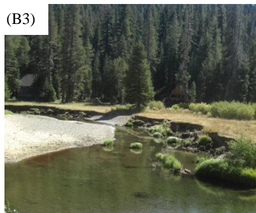
Bank height 2-4 feet, score=2 (Hermit Valley, Mokelumne Watershed)