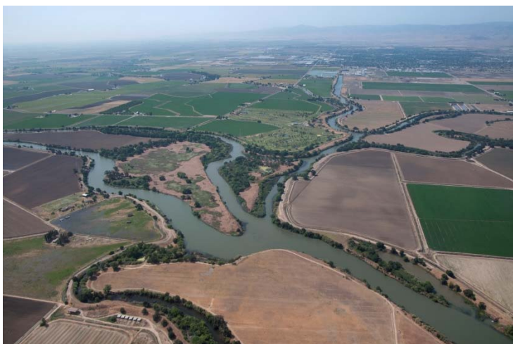
River diversion outside Stockton, CA