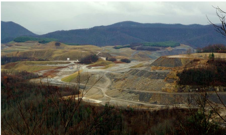
Mountaintop removal mining in nearby Wise County, VA