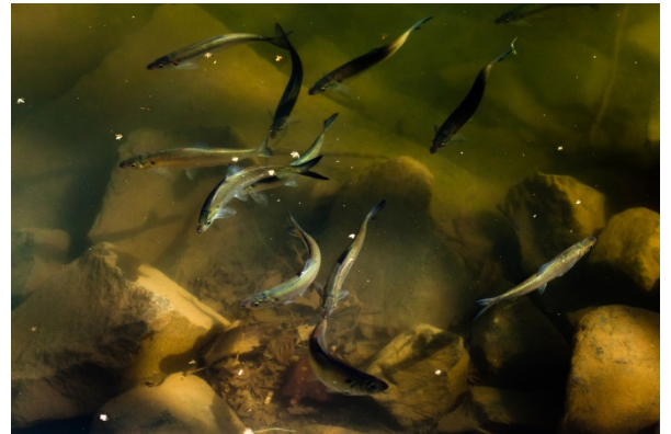
Alewife in Susquehanna River; Credit: Chesapeake Bay Program

We cannot let the hydropower industry avoid accountability at the expense of our fish, wildlife, water quality, public lands and outdoor recreation. For the millions who depend on the river and for generations to come—we must act now to save the mighty Susquehanna.