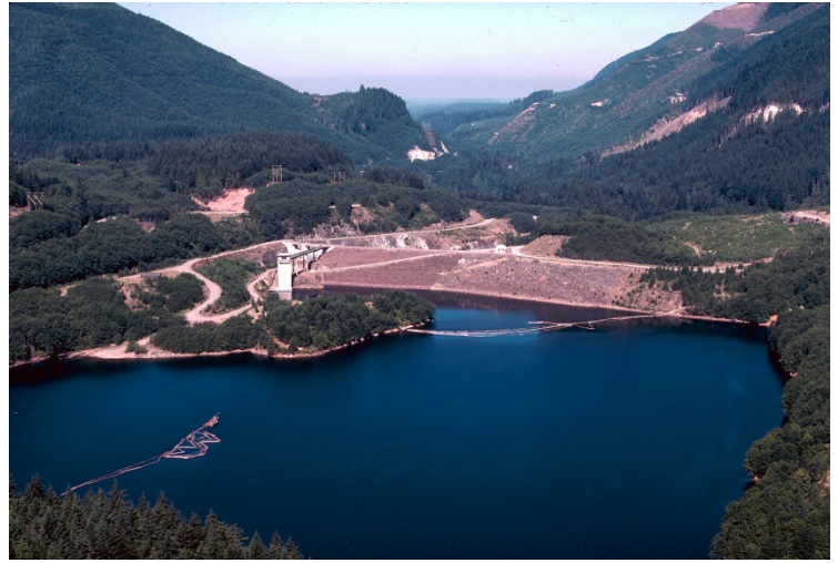
Howard Hanson Dam

In recent years, as few as 800 Chinook salmon have returned annually to the Green-Duwamish, and for the past 40 years wild Chinook returns have averaged less than 10% of the historic average adult return of 38,000. Nearly half the historic salmon habitat in the Green-Duwamish watershed lies above Howard Hanson Dam. Tacoma's diversion dam is already outfitted to pass adult salmon and steelhead above both dams, but experiments with downstream fish passage have shown that it is not worth sending adult fish above the dam until the juveniles can safely migrate downstream through the reservoir and structure of Howard Hanson Dam. Without access to the abundant, forested spawning habitat above the dam, salmon and steelhead recovery will remain compromised.