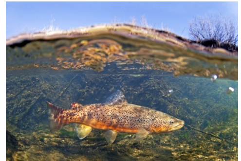
Brown trout in Smith River

In the bigger picture, Montana Governor Steve Bullock must send a clear signal to Tintina that for its Black Butte Copper Project to win state approval, it must be designed using standards never before required of mines in Montana due to the industry’s legacy of repeated failures. Any mine approved in the Smith’s headwaters must ensure with 100 percent certainty that it will not degrade water quality or the wild trout fishery in the river or its tributaries. This high bar must be established now, while the project is still in the planning phases. The Smith River is not the right place for a mining experiment based on unsubstantiated promises.