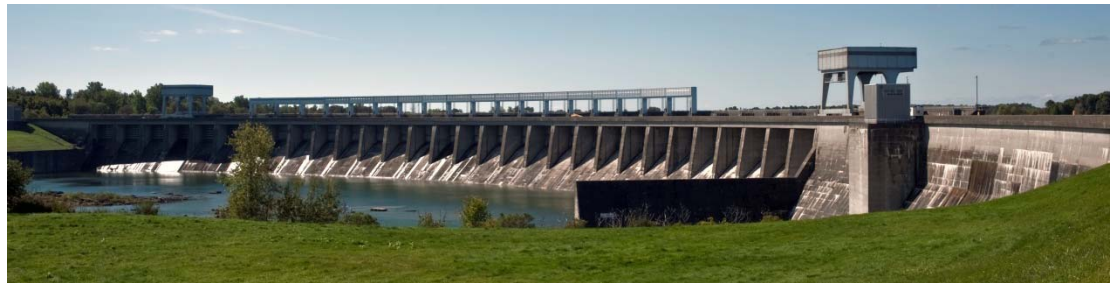
Moses-Saunders Hydropower Dam

regulated water levels. Environmental considerations were not part of planning in the 1950's when the dam and shipping channel were constructed. As a result, this outdated management strategy does not allow for the natural variability in water levels and flows essential to maintain a healthy river. Instead, current management significantly limits the range of water level fluctuations. The resulting artificially-constrained water levels have caused a loss of biodiversity in coastal wetlands and significant impacts to many fish species and nesting water birds.