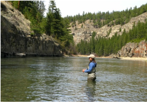
Fishing in Smith River

a copper mine underneath and directly adjacent to Sheep Creek, a major headwater stream that produces half of the tributary-spawning trout in the Smith River drainage and is a critical source of instream flows. The so-called Black Butte Copper Project would be located approximately 20 miles north of White Sulphur Springs. Within Montana, Tintina is touting the project as a modest-sized underground mine with an 11 to 14 year operating life that will bring jobs to White Sulphur Springs. However, to its out-of-state investors, Tintina is touting the potential for dramatically expanding the project and creating a “50-year mining district.”