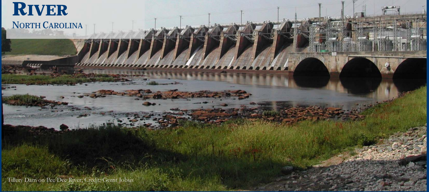
Tillery Dam on Pee Dee River