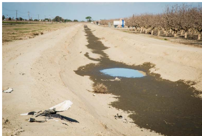
Dry irrigation channel