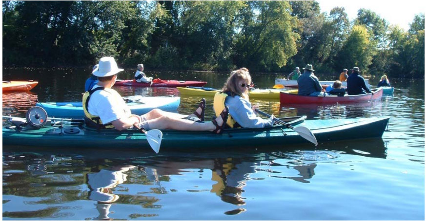
Paddling on the Merrimack River