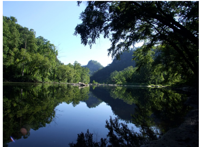
Breaks Interstate Park

As the region looks to the future for economic development, the Russell Fork and other rivers can be an asset for economic growth. We cannot allow such an economic engine for the region to be destroyed forever through destructive mountaintop removal practices. The time to act is now to protect this river.