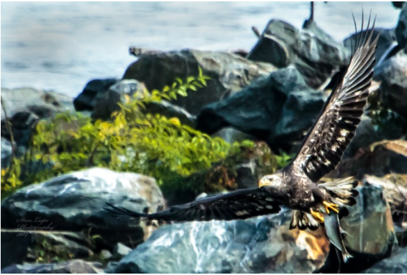
Eagle at Conowingo Dam; Credit: Stan Lupo [flickr]