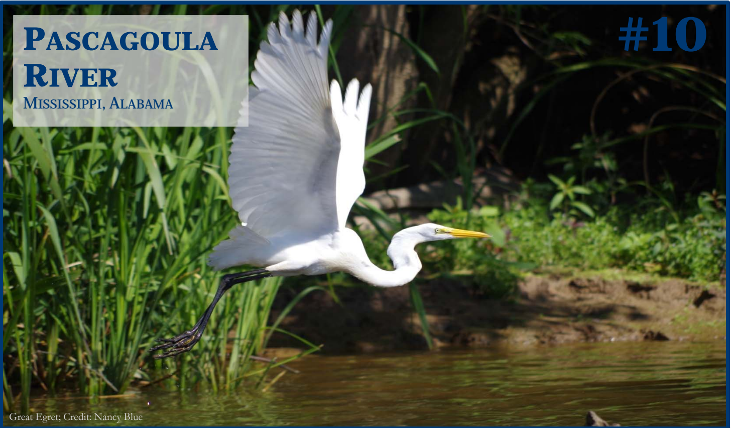
Great Egret; Credit: Nancy Blue