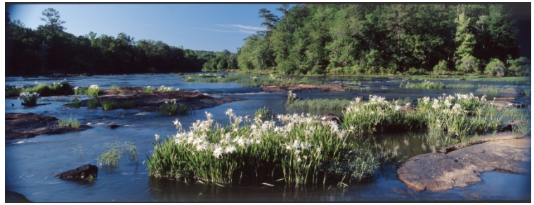
Shoal lilies on the Flint River

Excessive water use, particularly in fast-growing Georgia, is the chief threat to the ACF Basin, with the U.S. Army Corps of Engineers' mismanagement exacerbating the problem. The upper Chattahoochee River drains one of the smallest watersheds providing water supply to a major American city (Atlanta). The Flint River's headwaters supply water to Atlanta's southern suburbs at great expense to property values and river health. The Army Corps, which manages multiple dams along the length of the Chattahoochee River, has been unable to reconcile Georgia's growing water demands with needs downstream in Alabama and Florida. Across the lower basin, thousands of agricultural withdrawals from streams and the Floridan aquifer in all three states are dewatering the river system. Major lower-Flint tributaries run at low flows even in normal water years. In droughts, many run dry.