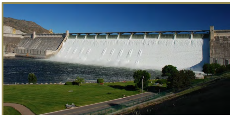
Grand Coulee Dam

Releasing more water from reservoirs during the spring and summer to help young salmon safely complete their journey to sea; 2) Restoring floodplain and estuary habitat in the lower Columbia River for the benefit of fish and wildlife and to ensure flood safety; and 3) Working to reintroduce salmon and steelhead above currently impassable barriers such as Grand Coulee Dam.