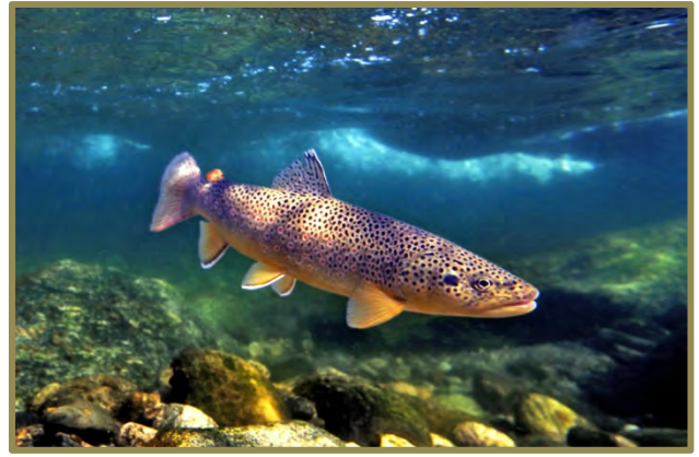
Brown trout; Photo: fisheyeguyphotography.com

Tintina claims the mine site is home to the, “third highest-grade copper deposit in development in North America.” However, removing that copper from the ground poses serious environmental risks. First, the copper lies in a massive sulfide-ore body, which, when exposed to air and water, can produce acid mine drainage. There is also the likelihood that the mine will leach toxic heavy metals such as copper into nearby surface waters; produce discharges of wastewater high in nitrates that result from the use of blasting compounds; and contaminate drinking water sources with arsenic. Finally, groundwater would have to be pumped from the mine, which could end up partially dewatering Sheep Creek or its tributaries, thus drying up trout habitat.