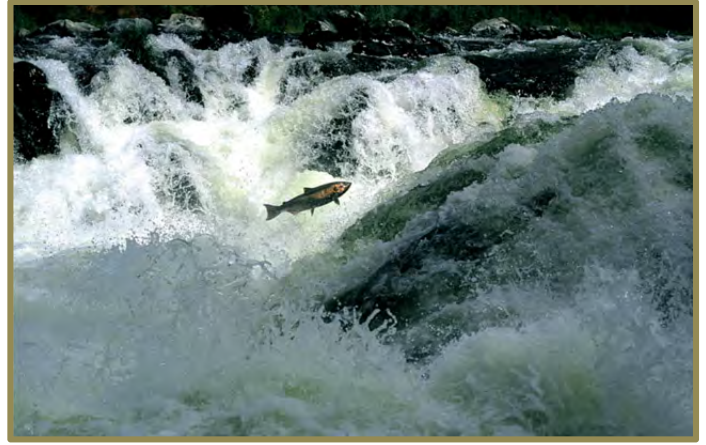
Rogue River Chinook salmon

Just over the ridge in the Smith River watershed, a foreign-owned mining company has submitted a plan to conduct exploratory drilling at 59 sites along important tributaries, across approximately 3,000 acres of the South Kalmiopsis Roadless Area. The Bush Administration recommended a portion of this watershed as Wilderness.