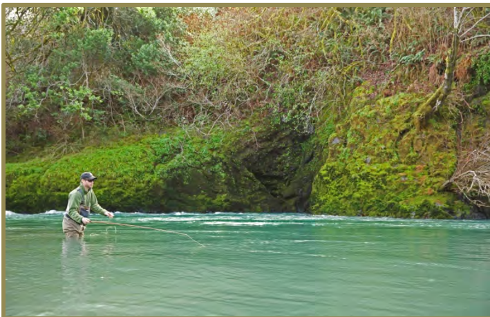
Pistol River