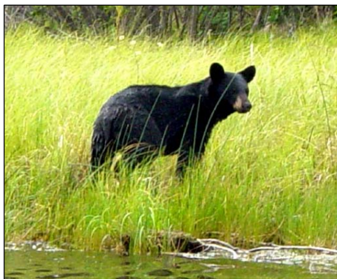
Black Bear

The largest block of old-growth forest remaining on the Gifford Pinchot National Forest lies on the north slope of the Lewis River, encompassing the Clear Creek and Quartz Creek tributaries. Clear Creek, Quartz Creek and Siouxon Creek are three of only five low-elevation, unroaded valleys in southern Washington. These valleys provide critical habitat for the federally-listed northern spotted owl and the entire North Fork Lewis watershed is important habitat for deer, elk, bear, cougar and other wildlife.