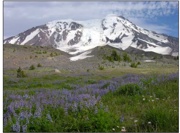
Lewis River Meadows (Susan Saul)

THE LEWIS RIVER originates high on the northwest flank of Mount Adams at the base of Adams Glacier and flows around Mount St. Helens before emptying into the Columbia River. The river and its upper tributaries – Rush, Clear and Quartz Creeks – offer powerful waterfalls, deep canyons clothed in magnificent old-growth forest, and green gardens of hanging ferns and mosses clinging to vertical basalt cliffs. The Muddy River and Pine and Smith Creeks begin on the slopes of Mount St. Helens with mist-shrouded waterfalls amid the roar of cascading water, displaying the effects of the 1980 eruption and the recovering landscape. Further downstream, Siouxon Creek is a crystal-clear stream flowing to the Lewis River, and Rush Creek provides critical habitat for threatened bull trout.