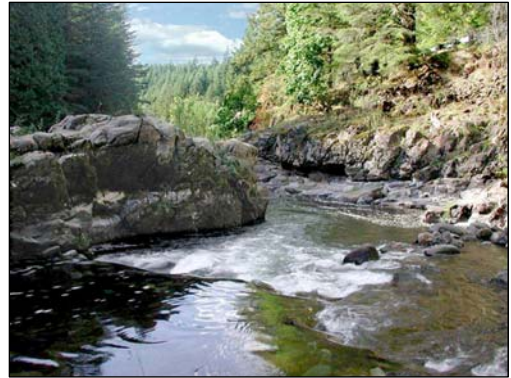
East Fork Lewis River

FLOWING FROM ZIG ZAG MOUNTAIN high in the Gifford Pinchot National Forest, the East Fork Lewis is one of the few major undammed rivers in Volcano Country. The East Fork Lewis is regarded as one of the most important rivers for producing wild anadromous (sea-going) fish in the Pacific Northwest, and is famous for its record-breaking winter-run steelhead. The East Fork Lewis is arguably the most popular recreational river in Southwest Washington other than the Columbia River.