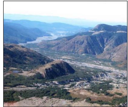
North Fork Toutle River Valley (USGS)

THE DRAMATIC 1980 ERUPTION of Mount St. Helens shapes the spectacular Toutle River system, including its major tributary, the Green River. The Toutle River headwaters begin just below Mount St. Helens' crater and flow west, picking up the Green River before its confluence with the Cowlitz. The debris avalanche that rushed down the Toutle River from the eruption is the largest landslide in recorded history. The Toutle River system offers extraordinary scientific study opportunities as well as geologic, recreational and scenic opportunities that are of national significance.