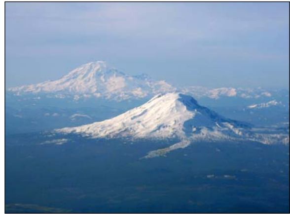
Mount Rainier and Mount Adams are sources of wild, free-flowing rivers

Washington's legendary volcanoes - Mount St. Helens, Mount Rainier and Mount Adams - are the source of wild, free-flowing rivers and streams that rush through deep gorges and basalt canyons on their way to the Columbia. Rivers like the Cispus, Green, Lewis and Wind are well-known for their outstanding recreational, fisheries, wildlife, historical, and scientific values.