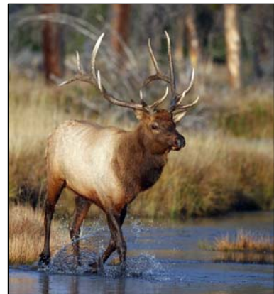
Wild and Scenic designation protects important habitat for fish and wildlife