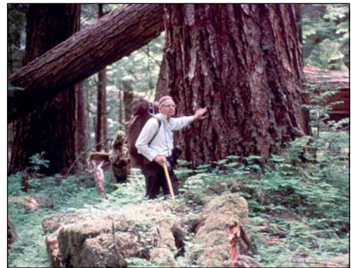
Green River Trail (Russ Jolley)

The Green River Valley was recently threatened by a proposed copper, gold, molybdenum and silver mining operation that could have encompassed up to 3,000 acres. Fortunately, the Bureau of Land Management and the U.S. Forest Service recently responded to public opposition by releasing an Environmental Assessment outlining their decision to not grant a lease to General Moly Inc. for mining in the Green River Valley. The mine proposal highlights the need for permanent protection through Wild and Scenic River designation to protect the Green River's free-flowing nature and its nationally-significant values for future generations. Designation would also assist in protecting the drinking water supplies of Kelso, Longview and other downstream communities, as well as the popular Green River horse camp and Green River and Goat Mountain Trails.