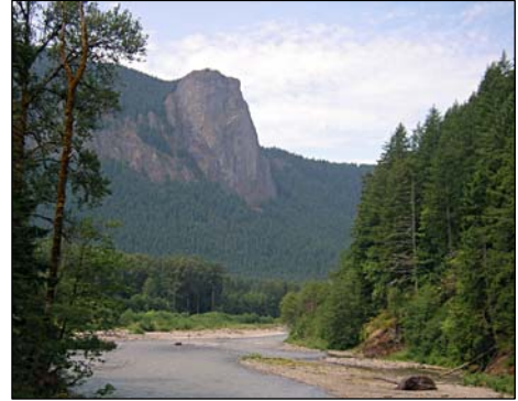
Cispus River and Tower Rock (Thomas O'Keefe)

THE CISPUS RIVER and its major tributary, Yellowjacket Creek, originate in the high country of the Goat Rocks Wilderness and Dark Divide Roadless Area. The river flows through spectacular geology in its upper reaches and then meanders through a unique section with high channel complexity that provides ideal fish habitat. The lower section of the river includes the stunning Tower Rock formation and provides many opportunities for good fishing, family-oriented whitewater boating and riverside camping.