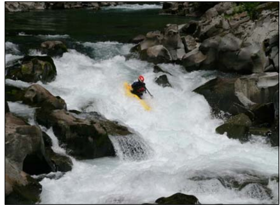
Kayaker on the Wind River

THE WIND RIVER WATERSHED harbors some of the Northwest's most magnificent landscapes, including some of the largest cedar and Douglas fir trees on the Gifford Pinchot National Forest. The Wind River's headwaters form in McClellan Meadows, west of the popular Indian Heaven Wilderness Area. The Wind River offers excellent recreational opportunities just over an hour from the Portland/Vancouver metro area and its protection is critical for conservation of the Northwest's unique biological heritage.