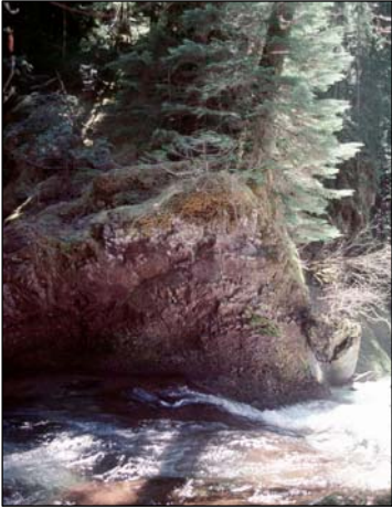
Quartz Creek (Susan Saul)

Steep gorges, waterfalls and plunge pools, whitewater rapids, and many waterfalls more than 10 feet high are part of the beauty of the Lewis River and its tributaries. Over time, the relentless power of water carved Cascade Gorge up to 800 feet deep and a mile wide through ancient volcanic formations. Upper, Middle and Lower Lewis River Falls spread in wide fans over massive blocks of basalt in a wall of water with many separate cascades. Rock layers have eroded at different rates, leaving behind the harder layers that create waterfalls and natural bridges, such as the one at Curly Creek Falls. On Mount St. Helens, the roaring, waterfall-laden Muddy River flows through a lahar (giant mud flow)-swept canyon scoured during the 1980 eruption. The canyon walls reveal ancient lava flows and spectacular cliffs of columnar basalt from previous eruptions.