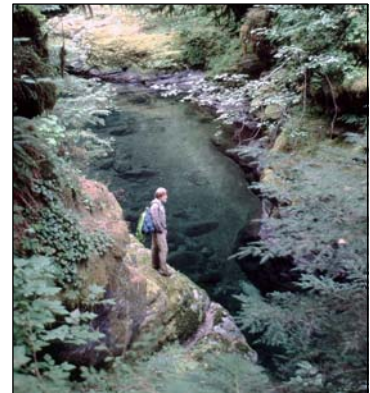
Hiking along Clear Creek (Larry Svart)

The Lewis River and its tributaries provide more than 40 miles of trails for hiking, backpacking, horseback riding and bicycling in the river corridor. Lower Falls Campground, located at Lower Lewis River Falls, is a highly popular and scenic recreation site. The lower reaches of the Lewis River and Siouxon Creek provide challenging whitewater boating. Trout fishing for native rainbow and cutthroat offer great opportunities for anglers, and the area is very popular with deer and elk hunters.