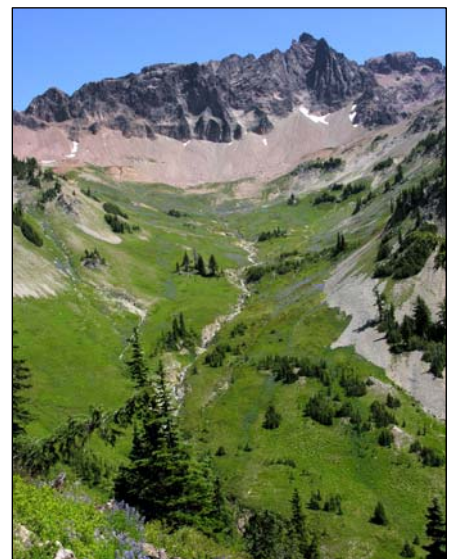
Cispus Headwaters (Susan Saul)

This river and its major tributaries have attracted the attention of hydropower developers. As recently as 1994, construction of the Cowlitz Falls hydropower project was completed where the Cispus River joins the Cowlitz River. Another project known as Cispus 4 was proposed and proceeded through the licensing process until the Washington Department of Ecology denied the required water quality permit on the grounds that recreational values of the river would be degraded. Several other hydro projects have been proposed in the watershed.