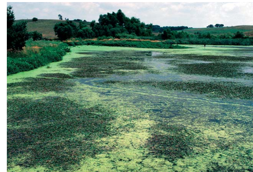
Stream networks filter and process everything from leaves and dead insects to runoff from agricultural fields and animal pastures. Without such processing, algal blooms can ruin living conditions for fish and the quality of drinking water. Here, algae overtakes a lake in Iowa.

Sustain Downstream Ecosystems – Ecological processes that recycle organic carbon contained in the bodies of dead plants and animals are essential to every food web on the planet. In freshwater ecosystems, much of the recycling hap-