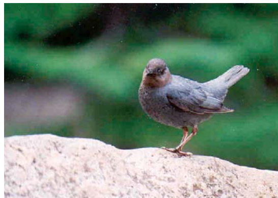
Bottom: American dippers rely on headwater streams for sustenance, walking along stream bottoms and feeding on insect larvae and crustaceans among the rocks of the streambed. This American dipper was photographed at Tanner's Flat, just east of Salt Lake City.