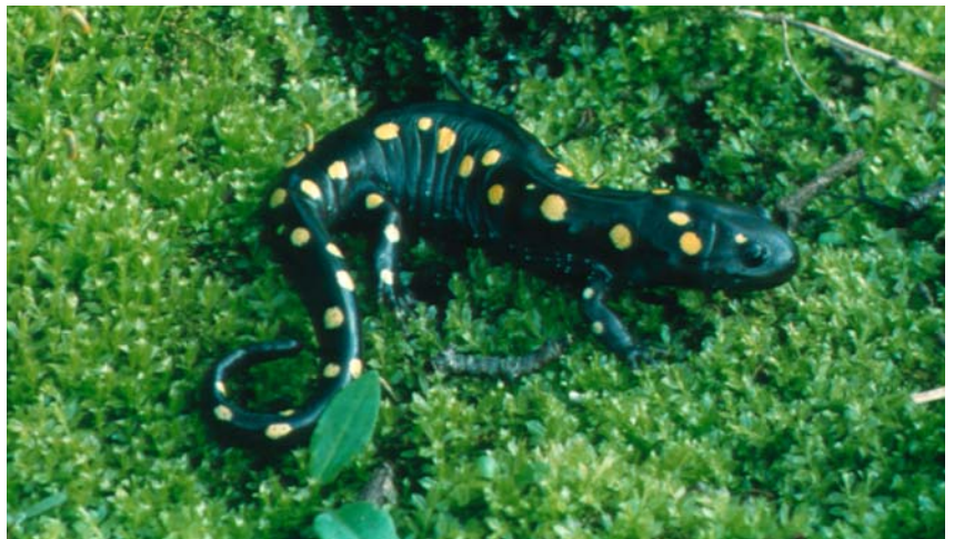
Top: Caddis flies and other aquatic insects spend their larval stage in streams, feeding on the algae, vegetation and decaying plant matter. The Brachycentris , a caddis fly found in headwater streams of eastern North America, constructs a protective case out of twigs, leaves and other debris.